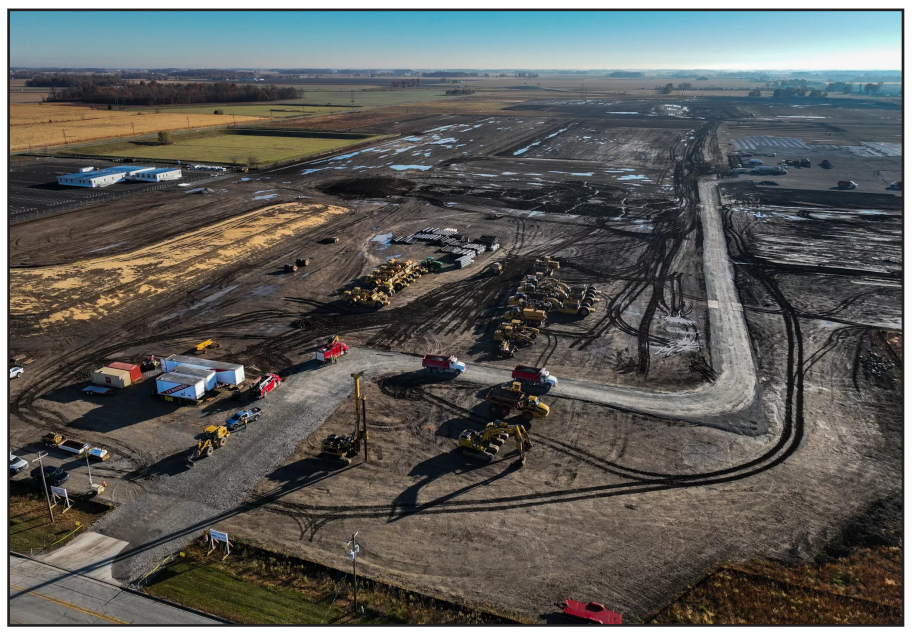
THE EV BATTERY PLANT BEING BUILT IN KOKOMO.