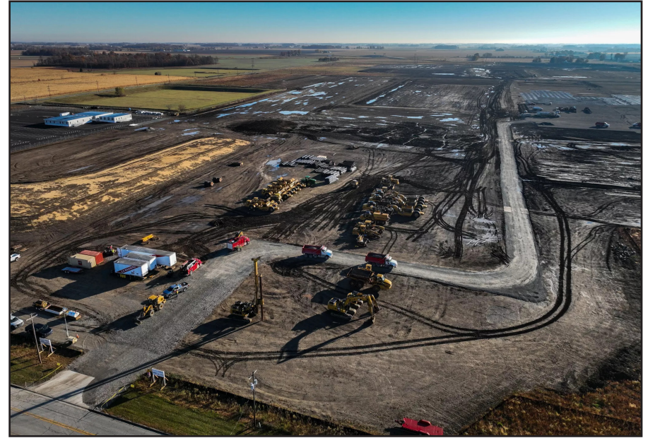
THE EV BATTERY PLANT BEING BUILT IN KOKOMO.